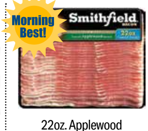
Smithfield Stack-Pack Bacon