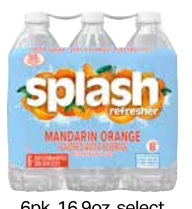
6pk. 16.9oz. select Nestle Splash Fruit Drinks