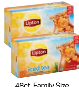
48ct. Family Size Lipton Tea Bags