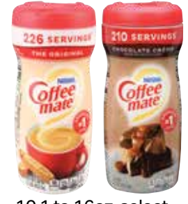
10.1 to 16oz. select Coffeemate Creamer