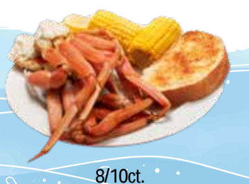
Frozen Crab Legs