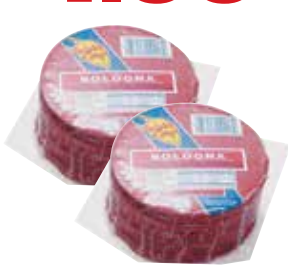
1lb. select Carolina Packers Bologna