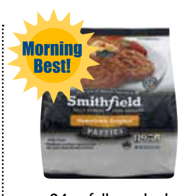
24oz. fully cooked Smithfield Sausage Patties