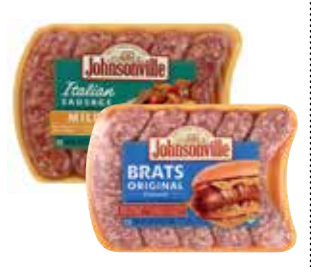
1.19lb. select Johnsonville Brats Or Italian Sausage PRICE $4,49