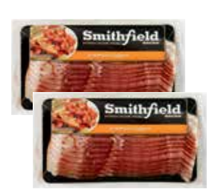
12oz. select Smithfield Sliced Bacon PRICE $4.99