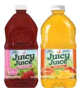
64oz. select Juicy Juice Drinks