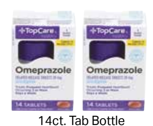
Top Care Omeprazole