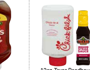
12oz. Texas Roadhouse Steak Sauce Or 16oz. select